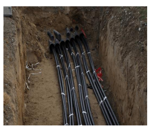
Olga Reed Elementary School Underground Electrical Project

Project total: $520,837.21 Year Completed 2022